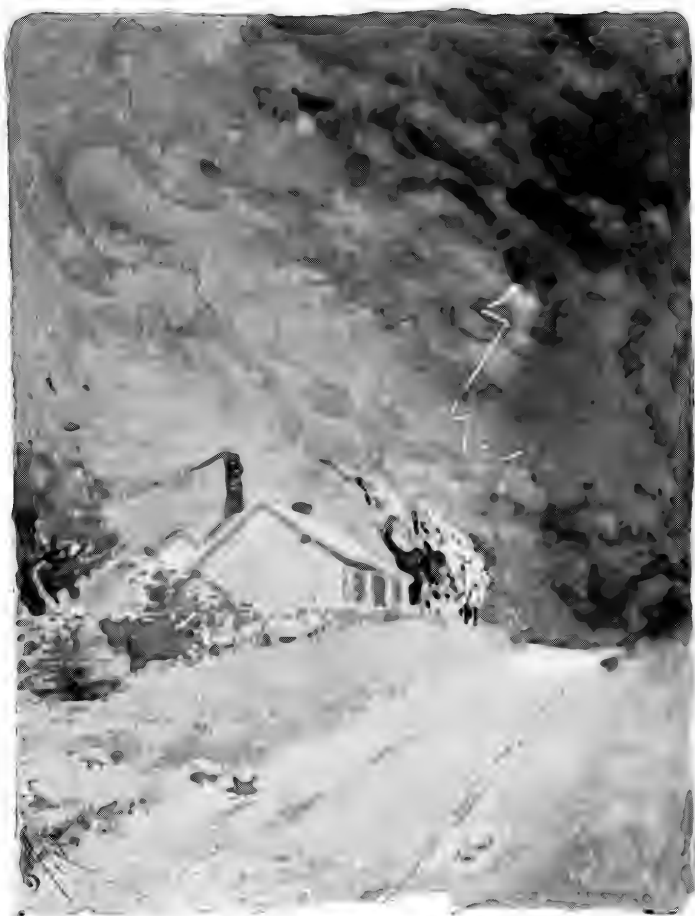
"A BLAZE THAT IS NEITHER NIGHT NOR DAY,"—Page 117.